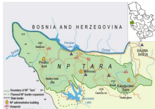
Figure 1. Map and position of the National Park Tara in Western Serbia

The National Park Tara covers most of the mountainous Tara region in the far west of Serbia, on the border with Bosnia and Herzegovina (Republic of Srpska). Tara is linked by the Drina valley from the north and west, the Rzav valley from the southwest, and by the Kremna valley from the south that separates it from the Zlatibor plateau. Mountain space is a unique geographic unit, about 45 km long and up to 18 km wide in the central part of the mountain and the average altitude of 1 200 m (Figure 1).